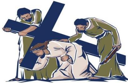
HOLY WEEK SCHEDULE

SUNDAY AT 8:00 AM, 10:00 AM, AND 12:00 NOON